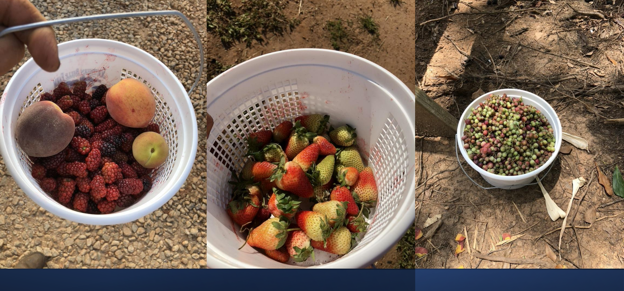
Disaster or Experience?