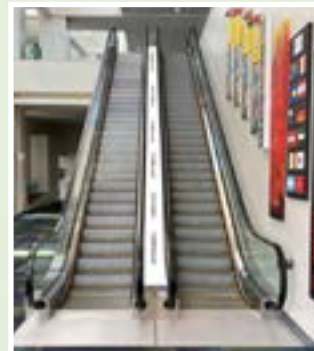
ESCALATOR RUNNER - $1,750 each