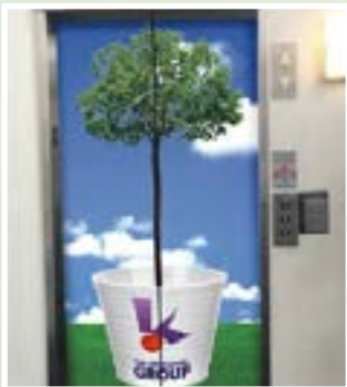
ELEVATOR DOOR GRAPHICS - $870/ elevator