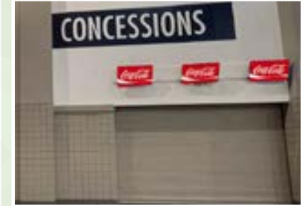
CONCESSION MONITORS - $2,500 each