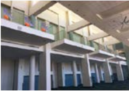
GLASS PANEL CLINGS ON SECOND FLOOR MEZZANINES - $810/space