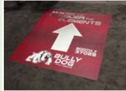
FLOOR CLINGS - $540 each