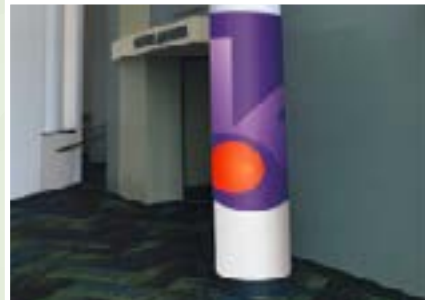
COLUMN WRAPS - $995 each