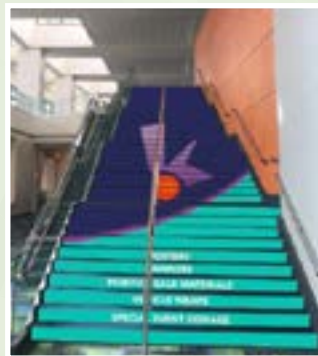
STAIRCASE GRAPHICS - $4,065/ staircase